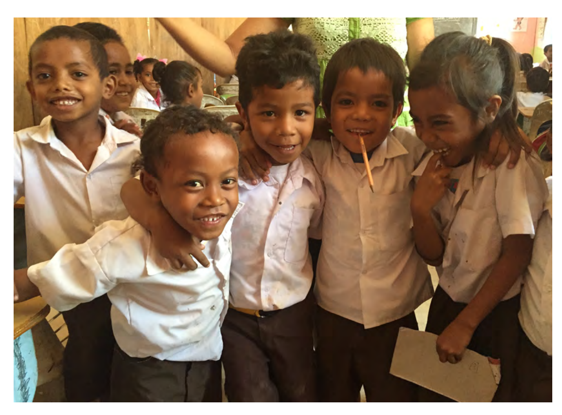
Macalaco Primary School